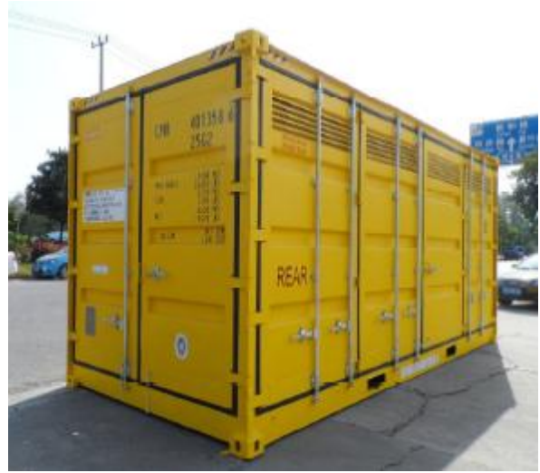
View in 45 Degrees (2)