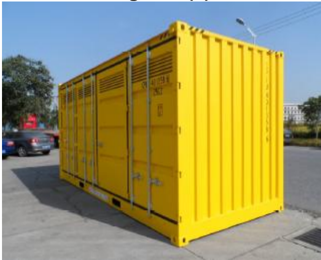
View in 45 Degrees (3)