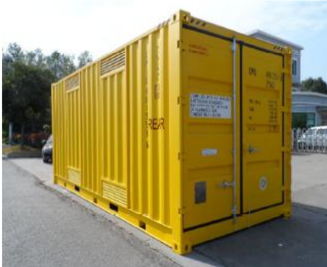
View in 45 Degrees (1)